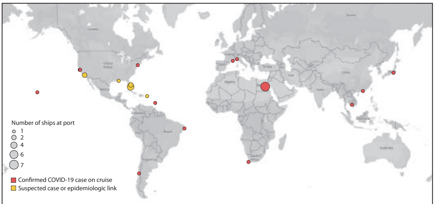
FIGURE 2. Cruise ships with coronavirus disease 2019 (COVID-19) cases requiring public health responses — worldwide, January–March 2020

Cruise ships are often settings for outbreaks of infectious diseases because of their closed environment, contact between travelers from many countries, and crew transfers between ships. On the Diamond Princess, transmission largely occurred among passengers before quarantine was implemented, whereas crew infections peaked after quarantine (6). On the Grand Princess, crew members were likely infected on voyage A and then transmitted SARS-CoV-2 to passengers on voyage B. The results of testing of passengers and crew on board the Diamond Princess demonstrated a high proportion (46.5%) of asymptomatic infections at the time of testing. Available statistical models of the Diamond Princess outbreak suggest that 17.9% of infected persons never developed symptoms (9). A high proportion of asymptomatic infections could partially explain the high attack rate among cruise ship passengers and crew. SARS-CoV-2 RNA was identified on a variety of surfaces in cabins of both symptomatic and asymptomatic infected passengers up to 17 days after cabins were vacated on the Diamond Princess but before disinfection procedures had been conducted (Takuya Yamagishi, National Institute of Infectious Diseases, personal communication, 2020). Although these data cannot be used to determine whether transmission occurred from contaminated surfaces, further study of fomite transmission of SARS-CoV-2 aboard cruise ships is warranted.